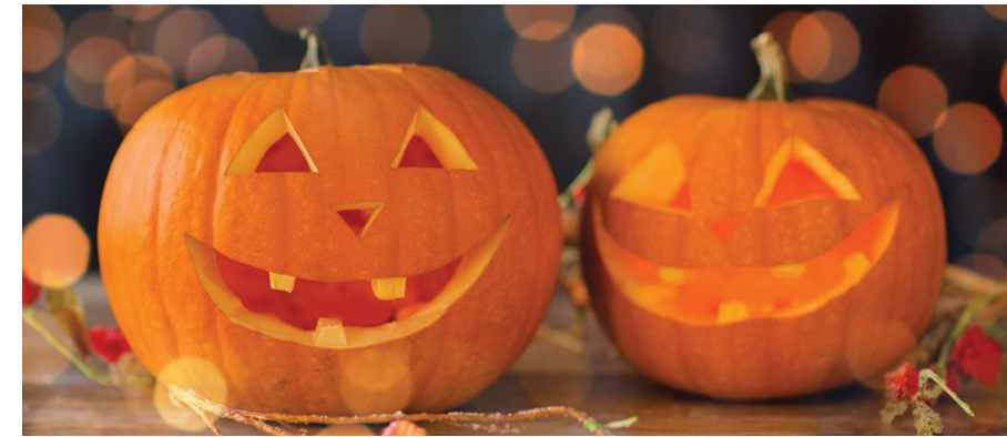
Trick or Treat on Main Street 3:00 pm to 5:00 pm on Halloween afternoon