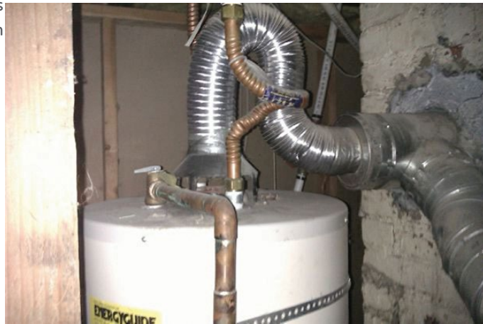
See anything of danger?

If you wanted to know when your building or by whom your building was constructed we would likely have that information for you. Our staff is available Monday thru Friday from 8 am to 5 pm except during major holidays.