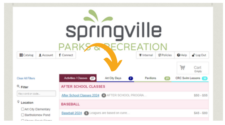
CLICK ON ART CITY DAYS VENDORS